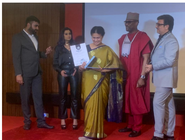
Felix School of Education judged the Best Holistic School in International School Awards, 2023 in Dubai.